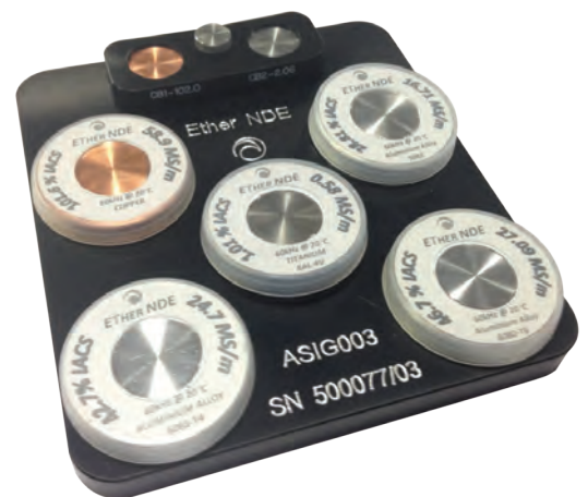
Conductivity Test Blocks In Holder

ETher NDE also manufacture individual conductivity test blocks which may be used to match the clients own testing requirements. We can also provide a handy test block holder (Part number: ASIG003) that can hold up to five of these test blocks at any one time as shown above.